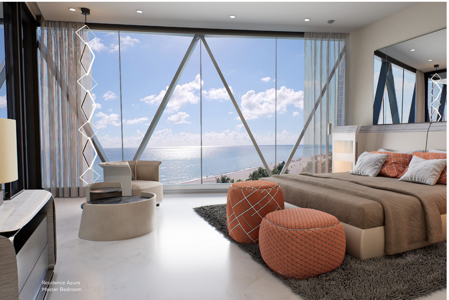
Residence Azure Master Bedroom

*A La Carte Services are arranged by the lifestyle concierge and are paid directly by residents.